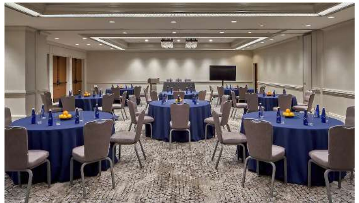
Reception - Grand Foyer on the Declaration Level (1B) Conference Space - Independence Level (5B)