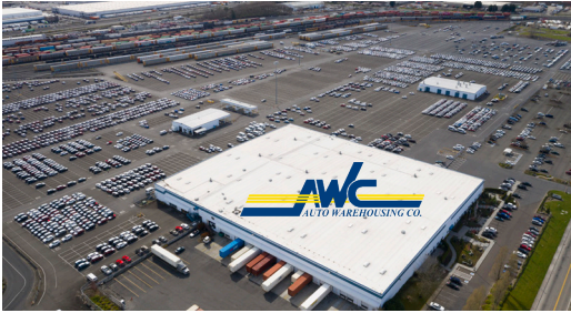
Marshall Avenue Auto Facility

The Northwest Seaport Alliance Has What it Takes to Handle Your Supply Chain Needs