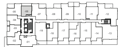
6TH - 8TH FLOOR