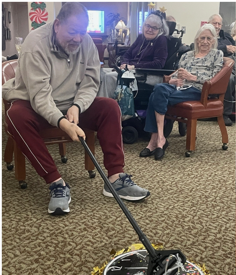
NYE Party went off with a bang by smashing the clock!