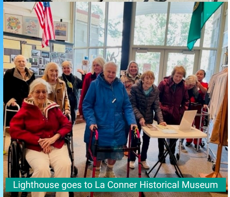
Lighthouse goes to La Conner Historical Museum