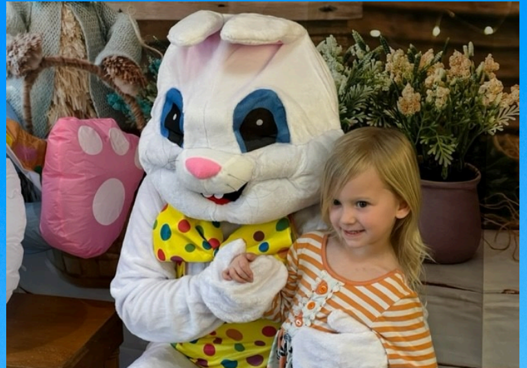
So much Easter Fun with all the littles!