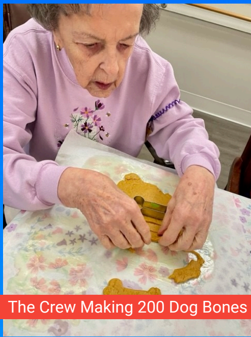
The Crew Making 200 Dog Bones