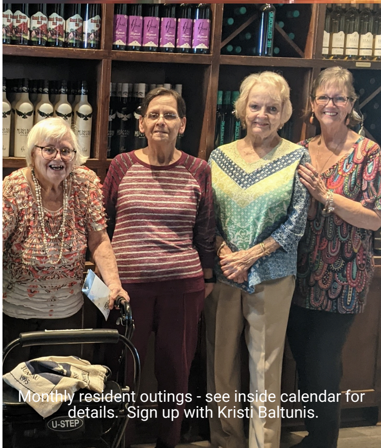
Monthly resident outings - see inside calendar for details. Sign up with Kristi Baltunis.