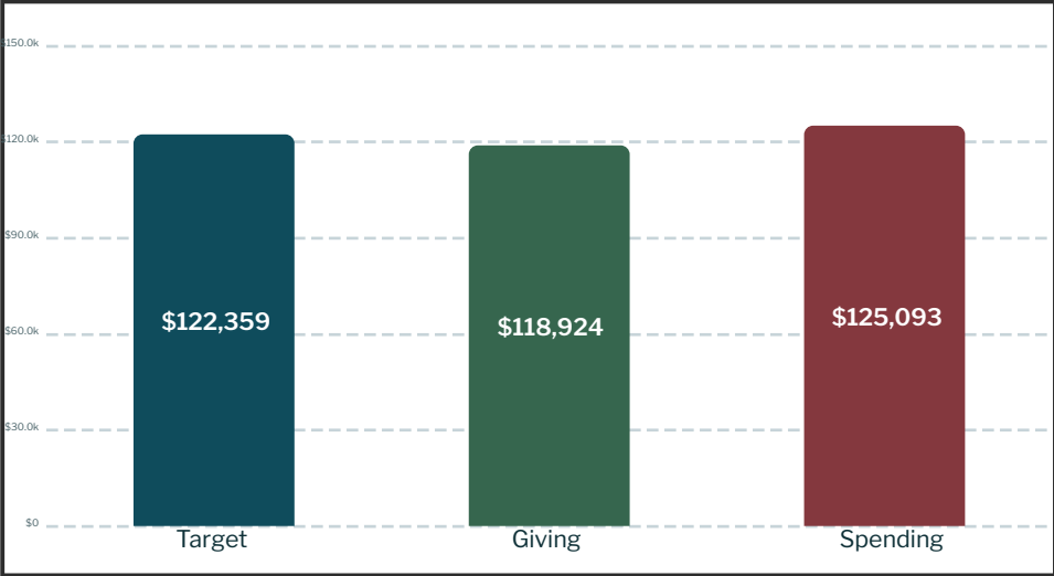
MAY GENERAL FUND ACTIVITY