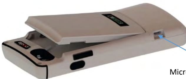
Micro-USB Charging Port

The battery fuel gauge LEDs will light up, indicating the battery's state of charge. The table below presents the charge definition per LED. The LEDs will turn off after approximately 15 minutes once the battery is fully charged.