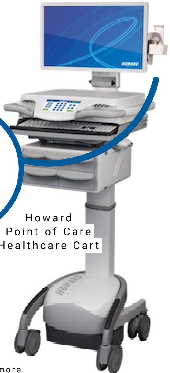
Howard Point-of-Care Healthcare Cart