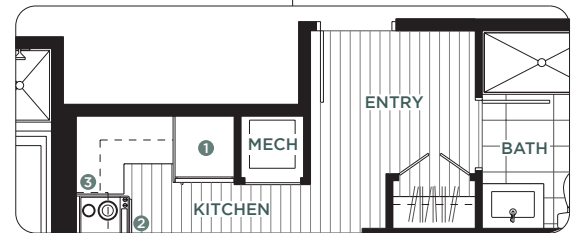
VARIANCE PLAN - BLDG1 #103