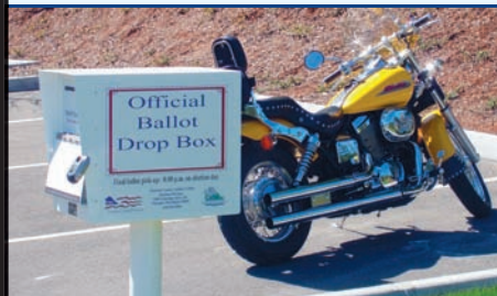
Fire 3 Station 35

Boxes are Open Now. All Boxes are Locked Promptly at 8:00 p.m. on Election Day. August 19, 2008