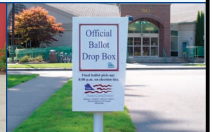
Tumwater City Hall

If you use a drop box, no postage is required.