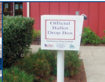
Fire 13 Station 1