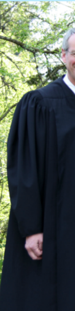
Judge M Judge V