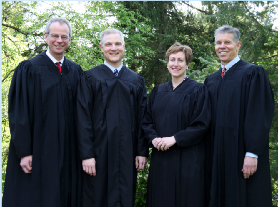
Judge Meyer, Commissioner Wohl, Judge Wilcox, and Judge Buckley