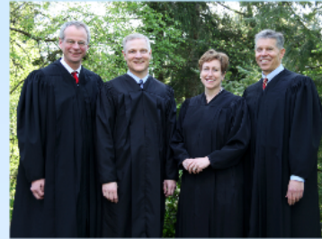
Judge Meyer, Commissioner Wohl, Judge Wilcox, and Judge Buckley