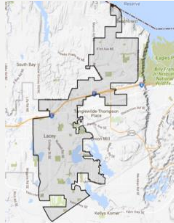
City of Lacey

*white area is unincorporated Thurston County*