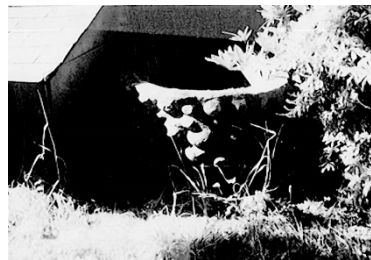
Hand Dug Well