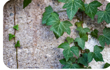
Ivy (all kinds)