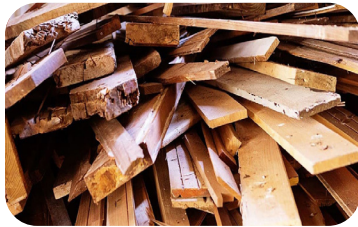
Treated Lumber (furniture, plywood, OSB, pressure treated, painted, stained)