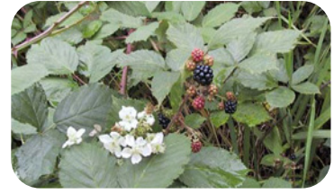
Blackberry (all kinds)