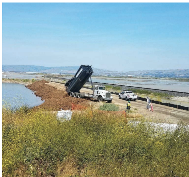
Soil delivered to Pond A12 for levee construction.