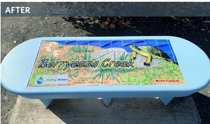
Public art on a bench in Hidden Lake Park, Milpitas.