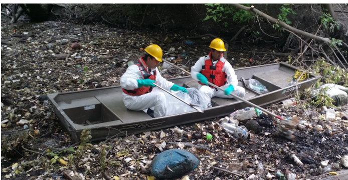
Trash cleanup along Guadalupe River in San José.

This project allows Valley Water to continue responding to requests for cleanup of illegal dumping, trash and graffiti on Valley Water's property and rights-of-way. Cleanup efforts include graffiti removal from floodwalls, concrete embankments, signs, structures and other Valley Water assets, as well as maintaining, repairing and installing fences and gates so that Valley Water structures and facilities remain safe and clean. The project also includes quarterly cleanups of problem trash sites to help reduce waterway pollution and keep creeks and riparian areas free of debris. The project also funds installation and maintenance of public art projects, such as murals, to beautify Valley Water property and infrastructure, to help deter graffiti and litter.