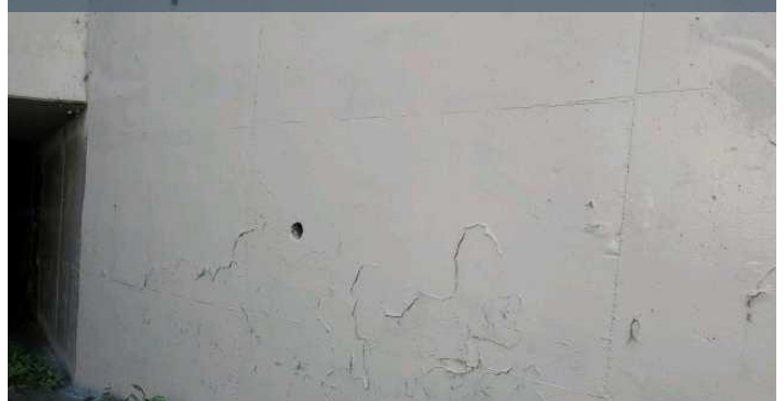
Graffiti removal at Stevens Creek in Mountain View.