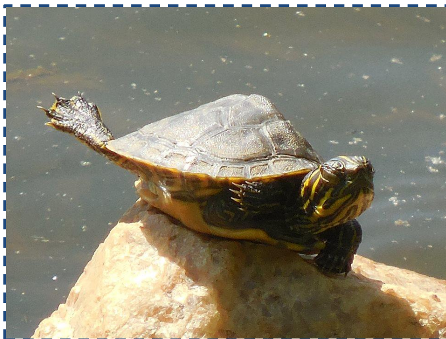
A Yellow-Bellied Slider basks in the sunlight down by the old mill stream.

If you are proficient at wildlife identification and/or take good nature photographs, we'd love to hear from you. Visitor wildlife records and photos can be added to our database and may also be shared on the park's social media sites.