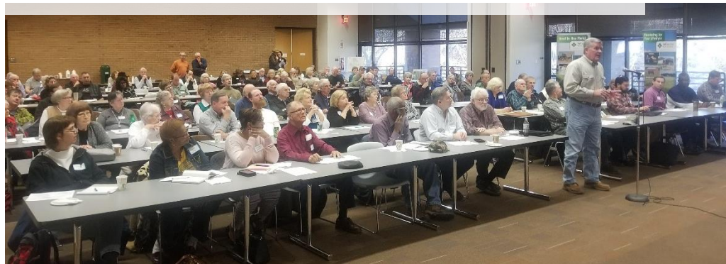
Wake Soil and Water Conservation and local agency partners hosted the 13 th Annual Keeping the Farm Workshop . Over 140 Wake County farm and forest landowners attended.

The staff worked with the Voluntary Agricultural District Advisory Board to manage Wake County's VAD Program, enrolling 1,271.42 new acres into this free farmland preservation program in FY2018.