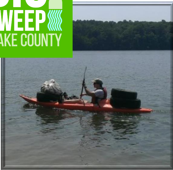
Big Sweep volunteers help clean up local waterways