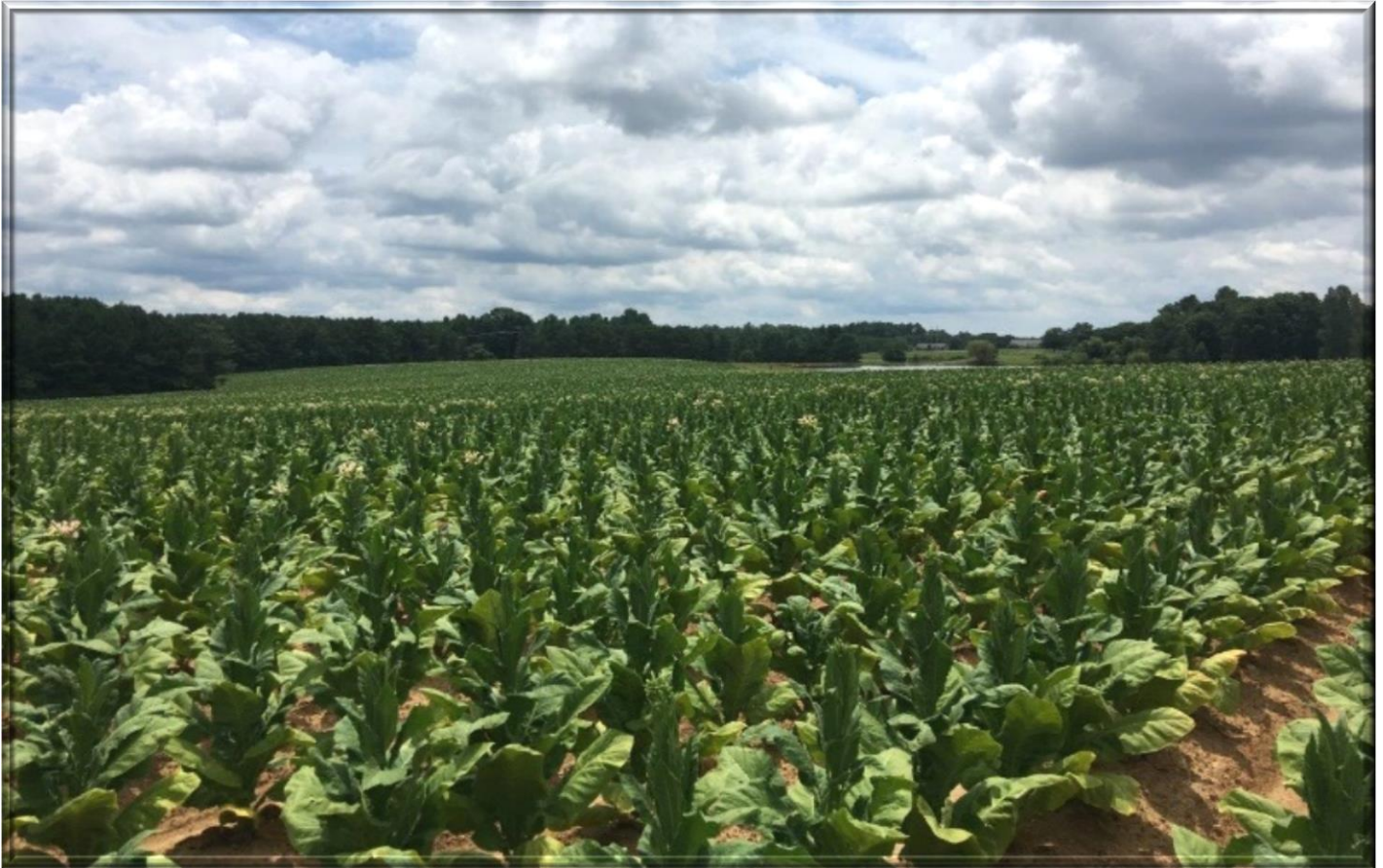
This tobacco farm in southern Wake County requires conservation practices to prevent sediment and nutrients from reaching streams.