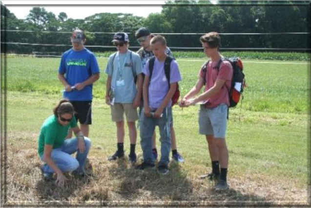
High School students learn about conservation and best management practices at the annual Resource Conservation Workshop.