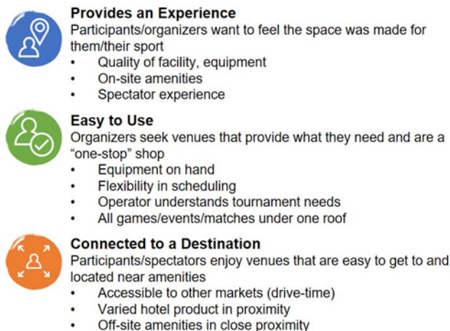
Figure 1: Market Demand Findings

In summary, the tournament organizers and experts relayed a consistent message of the importance of the total facility "experience" to support the athletes and the competitions, as well as having an attractive location for the facility, proximate to lodging and dining amenities. The interviews validated that tournament organizers across all levels of sports perceive Cary and Wake County as a desirable sports tourism destination. Feedback on optimal facility layout and design was factored into the overall direction for potential programming of the venue.