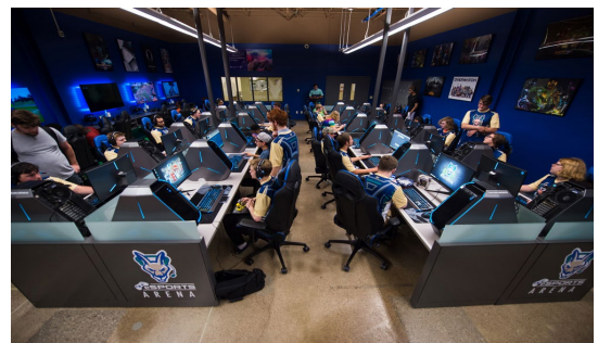
Potential E-gaming/ technology classroom usage

The facility would create a desirable location for indoor sports such as basketball, volleyball, wrestling, gymnastics, dance or cheer—in other words, what USA Baseball creates for youth and collegiate baseball, what WakeMed Soccer Park creates for youth, collegiate and amateur soccer, or what the Cary Tennis Park creates for tennis. Additionally, the meeting space component of the facility could augment the county's inventory and eventually add to the existing Cary Meeting District as defined by the Greater Raleigh Convention and Visitors Bureau for meetings and conventions in the county.