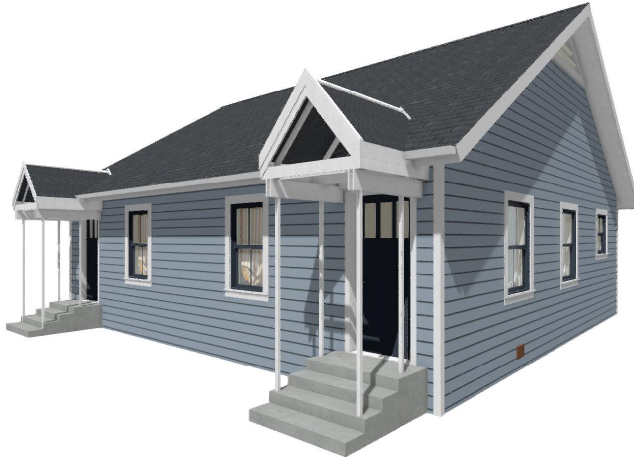
1315 wylie street existing structure