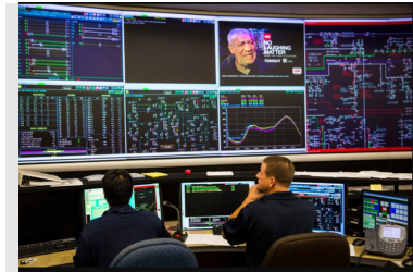
Solar Control Room